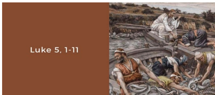
Luke 5, 1-11

By human standards, the command Jesus made to Simon Peter: “Put out into deep water and lower your nets for catch,” was as foolish as Simon’s acceptance of the instruction. Fish only come to the surface for food at nighttime – during daylight they remain on the bottom of the sea, so a haul was highly unlikely. Yet something in Jesus must have struck a chord in Simon’s heart, which prompted him, against his better judgment, to obey. The outcome surpassed his wildest dreams. His faith and perseverance were rewarded with a bumper catch. Peter took a risk, and as a result realized he was in the presence of someone who was more than a man. His reaction was to get down on his knees and say, “Leave me Lord, I am a sinful man.” Ignoring the remark about being a sinner, Jesus invited Peter and his friends to abandon their boats and nets and join him in his mission, his new venture to seek out and save the lost. Without a second thought, they set off on a vocation that would bring them to a way of life beyond their expectations and desires.