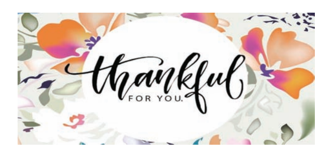
Thank you to everyone who have been able to continue supporting our parish during these unpredictable times.